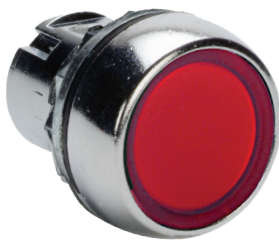
D7M – Die-cast metal housing and locking ring with shiny metal captive bezel.