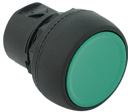
D7P – Plastic housing with a black plastic captive bezel.

Front elements, including pushbuttons, mushroom operators and selector switches, are IP 66 protection against submersion, oil and dirt, making them reliable in the toughest industrial environments. Metal operators are Type 4/13 and plastic operators are Type 4/4X/13.